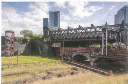
Image: artist's impression copyright Twelve Architects & Masterplanners; Castlefield Viaduct, National Trust Images