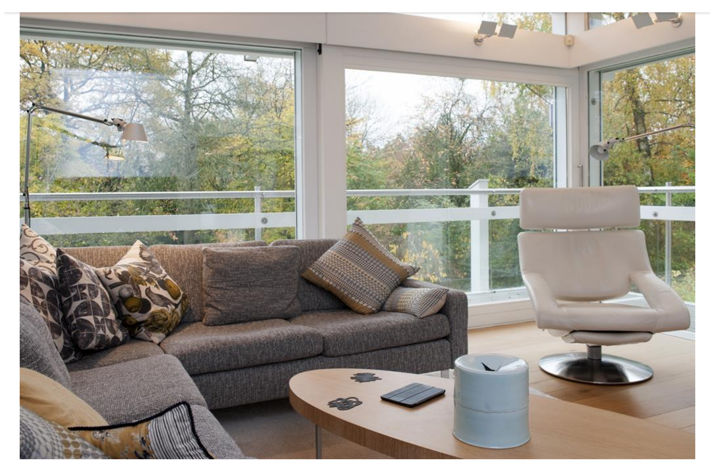
Touch of glass: Each room over three levels has 7.6ft double-glazed glass-sliding panels

Balconies and private terraces hug the house on the ground and the first floors, while on the roof the large overhang means rain never lashes against the windows.