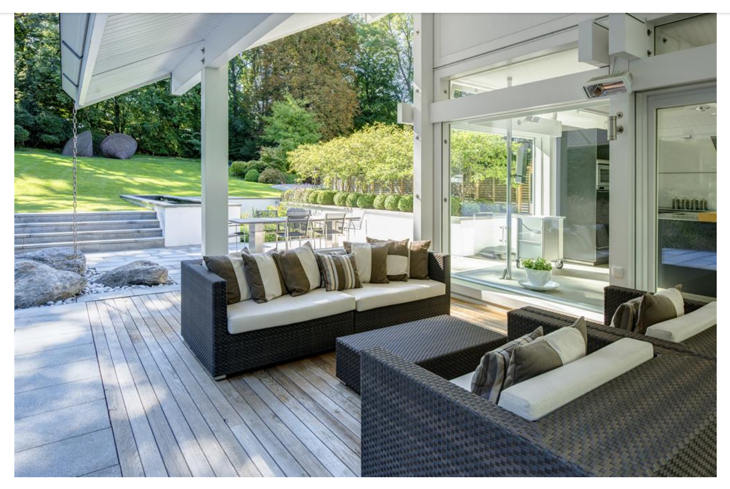
Great outdoors: A covered terrace makes for a tranquil relaxation spot

There's a contemporary fireplace between the dining room and the family room while the spacious living room is nearby. Each room is bordered by sliding 7.6ft double-glazed glass sliding panels.