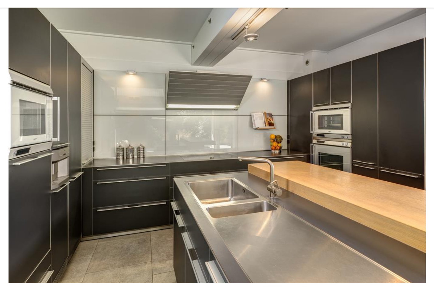
Slick: The house has a Bulthaup kitchen with Gaggenau appliances