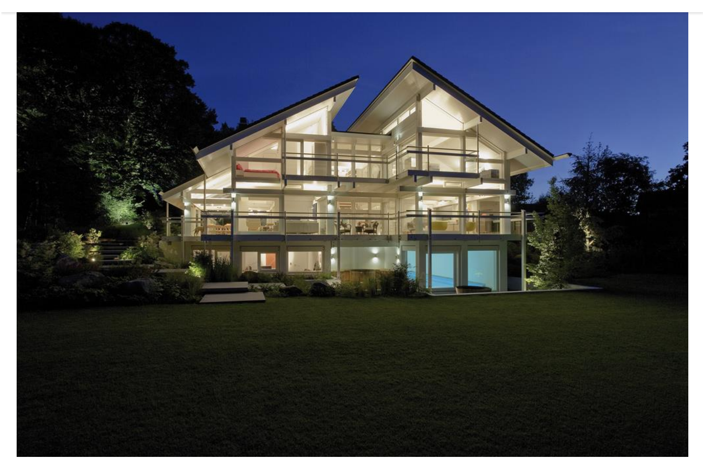
Outstanding in its field: The property is the only Huf Haus built over three levels

Today it is a gleaming testament to the ideology of Huf Haus, a German family company based in Hartenfels, 75km south of Bonn, which has operated for 104 years and has more than 100 homes in the UK.