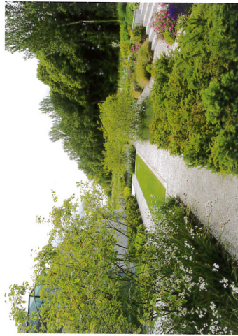
ABOVE The more formal courtyard behind the building LEFT Views of the surrounding Sussex Downs can be enjoyed from several different seating areas