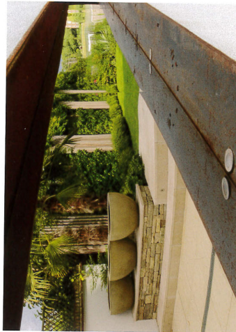
ABOVE Mirror-lined recesses in the walls help to make the space appear wider LEFT Pebble-lined water bowls sit on a Purbeck Stone Shelf