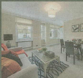
MAYFAIR, W1 £725 per week + admin fees apply*

To discuss your property requirements please call us on 020 7877 4640 - available 7 days a week