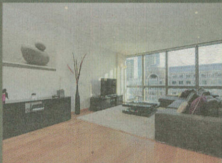
CANARY WHARF, E14 £885 per week + admin fees apply*