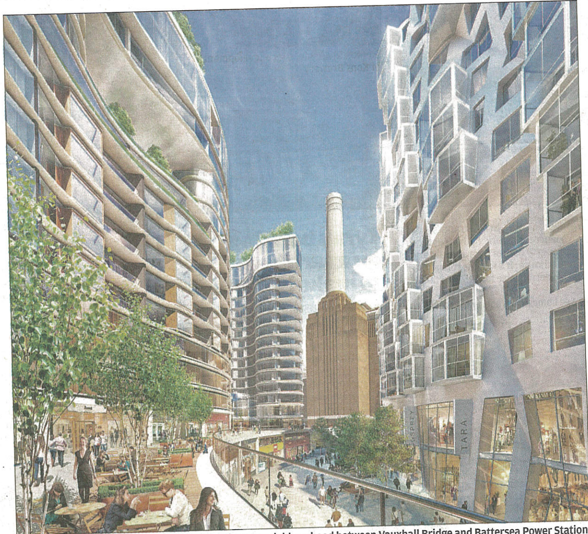
Future is bright: Nine Elms and the creation of a new neighbourhood between Vauxhall Bridge and Battersea Power Station

Among the exciting range of new watery spaces proposed are floating gardens in Docklands, a linear lido along Regent's Canal, between Little Venice and Limehouse, and a reinstated River Fleet channel as a new