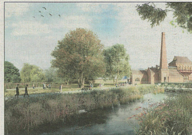
Wild for nature: Walthamstow Wetlands will be built around Lee V

from £450,000. Call 0800 0886 777. New South Quarter , off Purley Way, also borders the Wandle, and is close to Croydon town centre. This scheme of studios and one-, two-, and three-bedroom flats is being built on the site of a former gas works, and part of the regeneration involves upgrading adjacent Wandle Park. Prices start from £257,000 and range up to £499,000. Call 0844 811 4334.