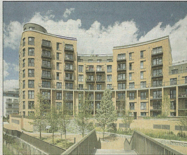
From £257,000: homes at New South Quarter border the Wandle