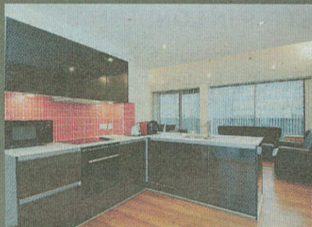
SHOREDITCH, N1 Guide price £999,999