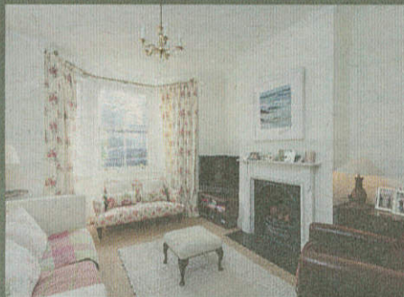
WIMBLEDON, SW20 Guide price £985,000