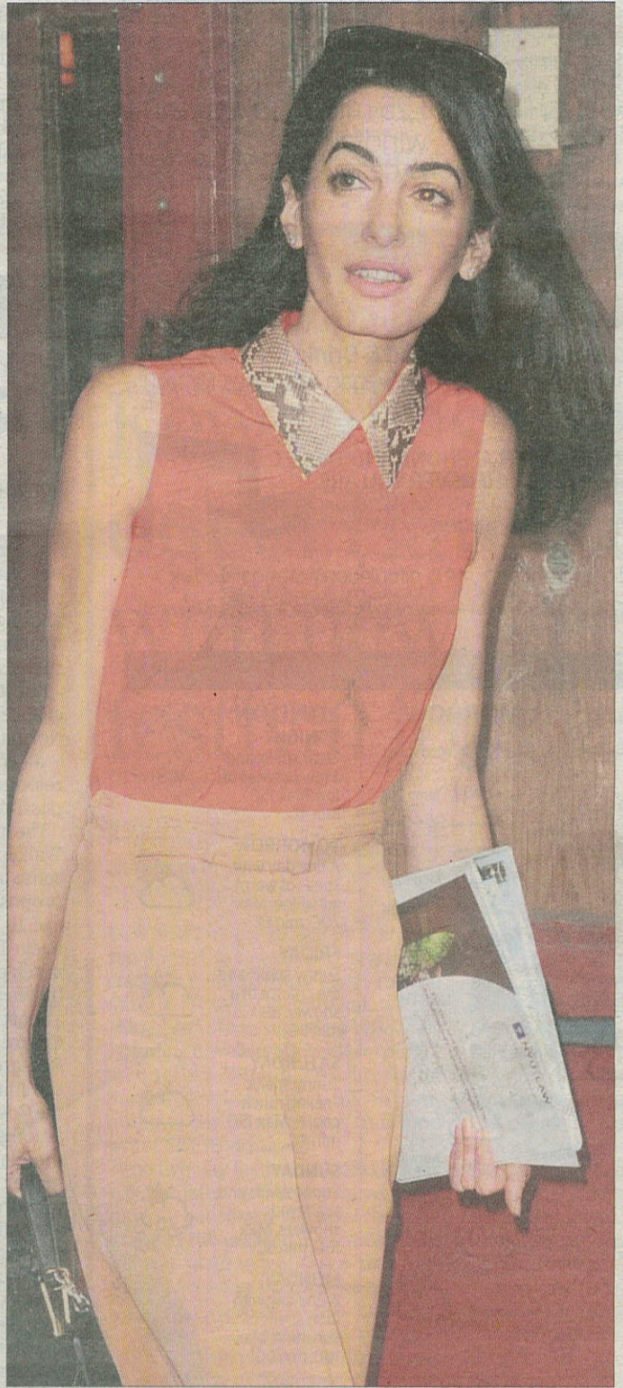
Elegant: Amal Clooney is the epitome of style in a sleeveless top with snakeskin-print collar as she leaves a restaurant in New York. The 37-year-old lawyer was taking a break from teaching at Columbia Law School