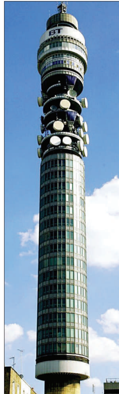
Classic design: the BT Tower, right, has become one of London's most familiar landmarks – especially for cyclists

shop is open from Friday to Sunday only, but he now has an outlet in Selfridges as well. His incredible neon creations definitely have a place in the garden or home.